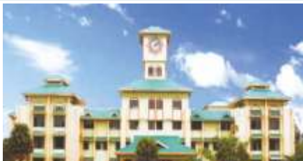
Ahalia Ayurveda Medical College Hospital, Palakkad