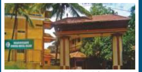
MVR Ayurveda Medical College Parassinikadavu, Kannur