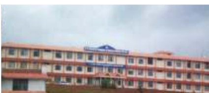
P.N.Panicker Souhruda Ayurveda Medical College, Kasargod