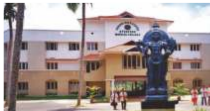
Pankajakasthuri Medical College, Thiruvananthapuram