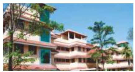
Mannam Ayurveda Co-operative Medical College, Pandalam