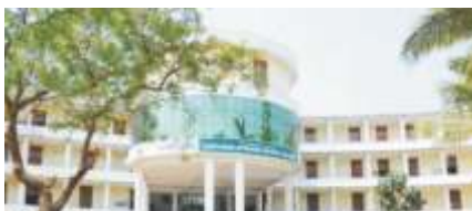
Santhigiri Ayurveda Medical College, Palakkad