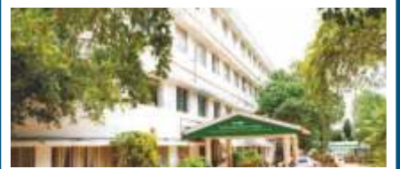
Santhigiri Siddha Medical College, Thiruvananthapuram