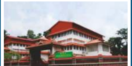
P.N.N.M Ayurveda Medical College, Shoranur