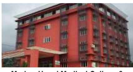
Markaz Unani Medical College & Hospital, Kozhikode