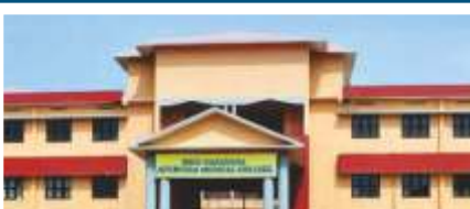
Sree Narayana Institute of Ayurvedic Studies & Research, Puthur, Kollam