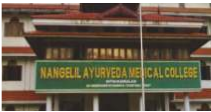
Nangelil Ayurveda Medical College, Kothamangalam