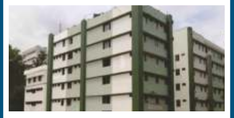
KMCT Ayurveda Medical College, Calicut