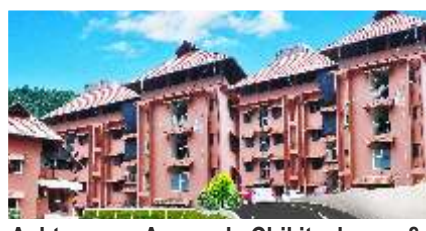
Ashtangam Ayurveda Chikitsalayam & Vidyapeedham (AACV), Vavanoor